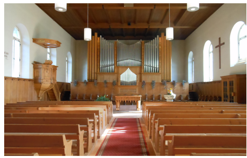
Unterseen Church Choir

Working together with selected subcontractors and an ecologically-minded church organization by the name of oeku Kirche und Umwelt, we developed the ProChileWatt funding program. Offering program funding of up to 40% of total investment costs, we were able to encourage numerous congregations to carry out the necessary renovations. Thanks to the program, churches have already saved more than 27 GWh of power.