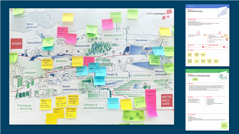
Formulation of a shared vision