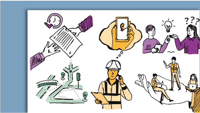
Excerpt of the illustrations