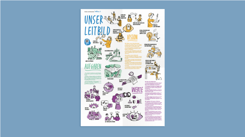
Realization folding flyer