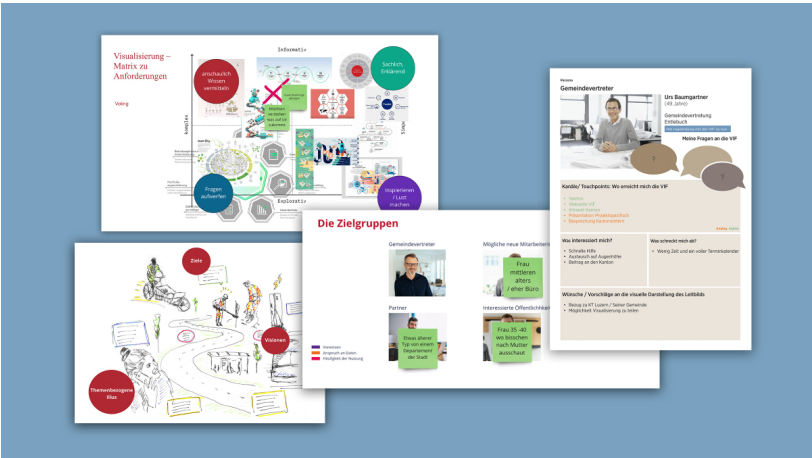
Excerpts from the workshops for the development of the mission statement