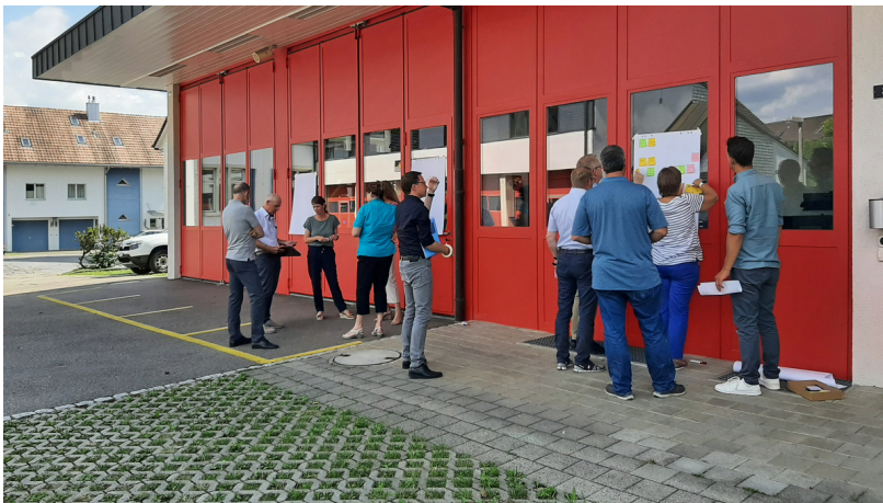
Preparatory workshop in the runup to the municipal assembly