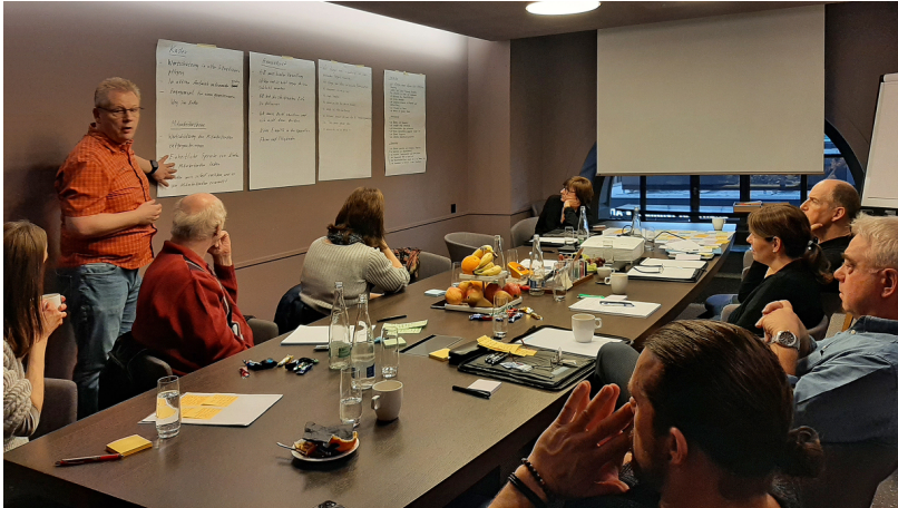
Collaboration culture workshop