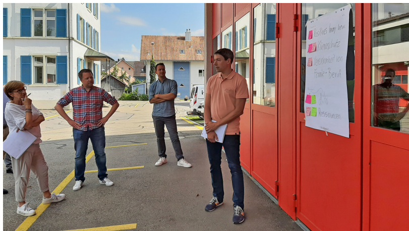
Presentation of risks and opportunities