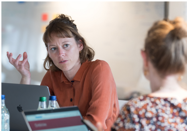
BIM seed development process at the EBP BoostCamp