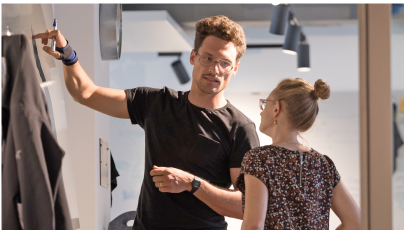
BIM seed development process at the EBP BoostCamp