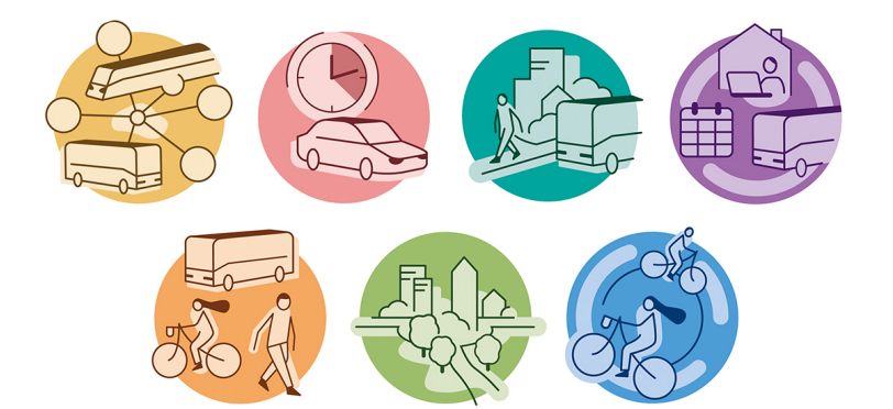
Icons to visualize the objections of the Overall Transportation Concept for Baden and surrounding areas