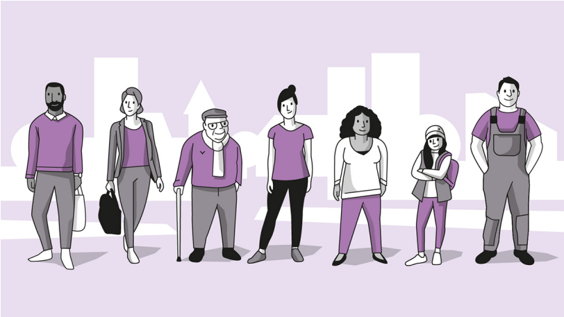
Illustrations to visualize the relevant target groups