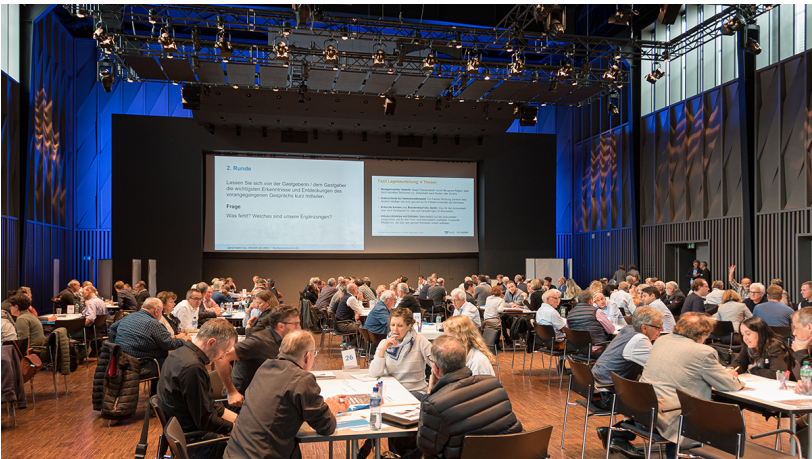
Photo of the first Mobility Conference 2022