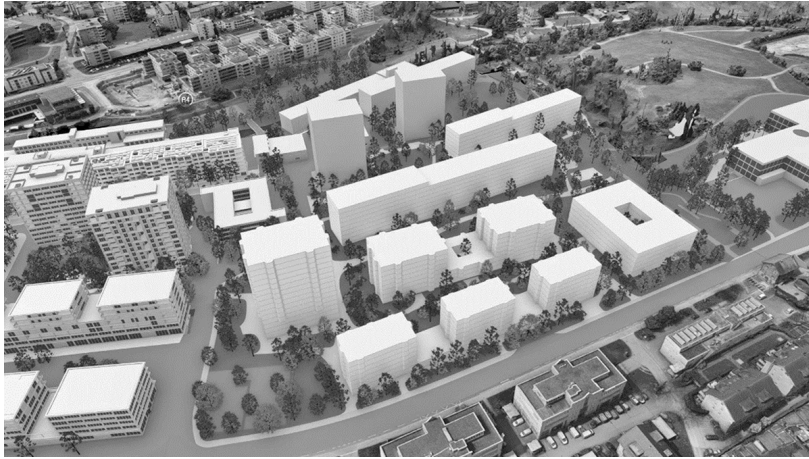
3D model (Raumgleiter AG) of the winning project (ARGE Ramser Schmid und Enzmann Fischer)