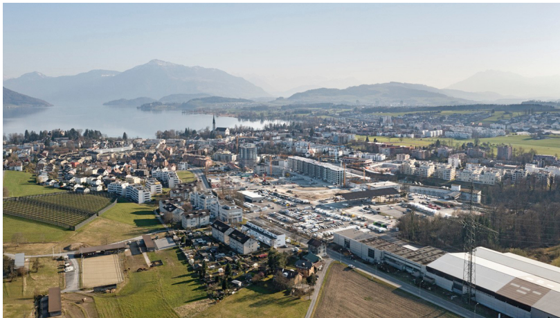
Aerial view of Papieri and Pavatex Süd site development: photograph by Beat Bühler